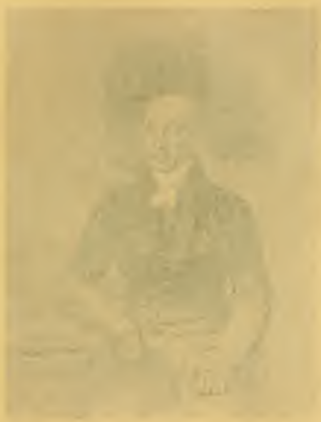
Portrait of Szczęśliwy Kościuszko, 1794