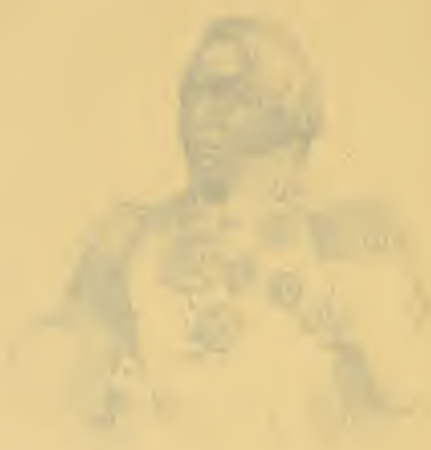
Portrait of Prince Kuluza