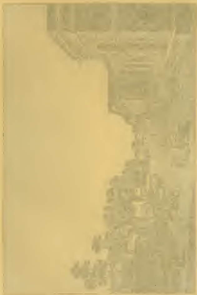
Spöranski's House