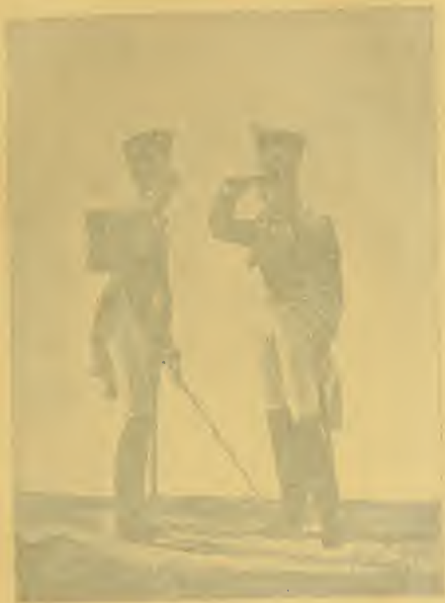
Russian Infantry Officers, 1811. Illustration from Warfare in the 18th Century .